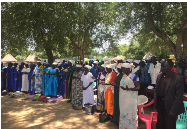
Worshippers in Prayer