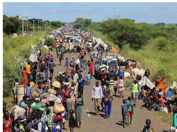
Refugees leaving South Sudan